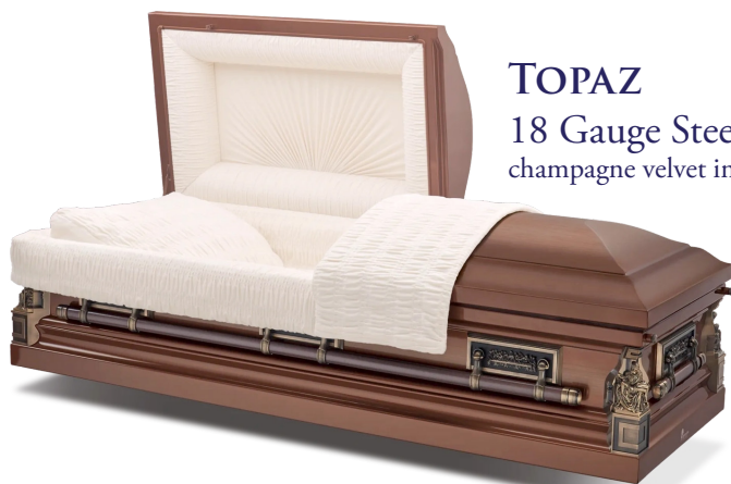
TOPAZ 18 Gauge Steel J35 champagne velvet interior