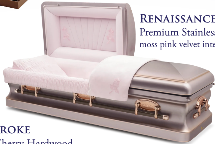
RENAISSANCE ROSE Premium Stainless Steel OR6 moss pink velvet interior