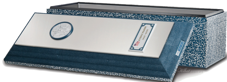
VETERAN'S STAINLESS STEEL TRIUNE stainless steel and polymer lined 3,000 lb. concrete burial vault