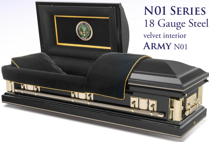
N01 SERIES 18 Gauge Steel velvet interior ARMY N01