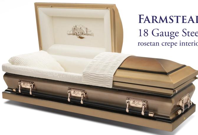
FARMSTEAD 18 Gauge Steel HB1 rosetan crepe interior