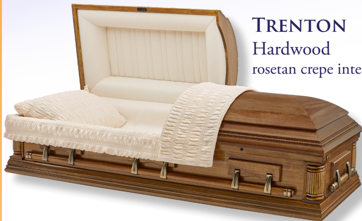
TRENTON Hardwood rosetan crepe interior