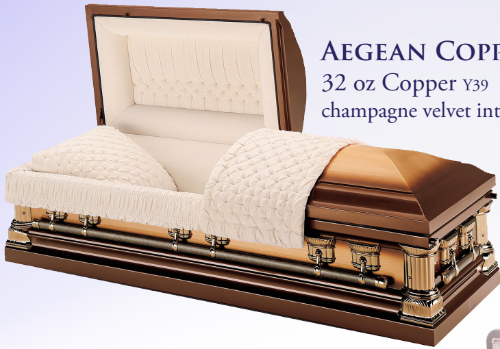
AEGEAN COPPER 32 oz Copper Y39 champagne velvet interior