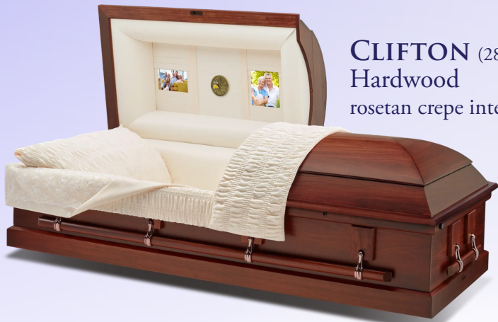
CLIFTON (28) Hardwood rosetan crepe interior