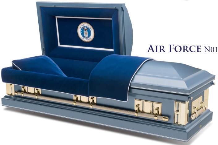
AIR FORCE N01