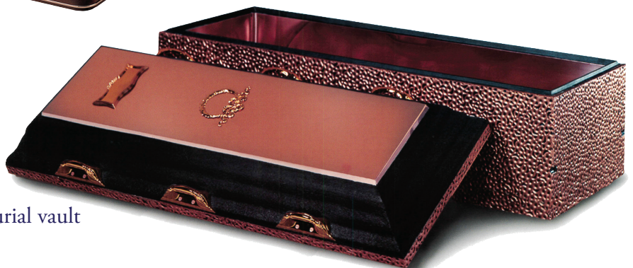
COPPER TRIUNE copper and polymer lined 3,000 lb. concrete burial vault