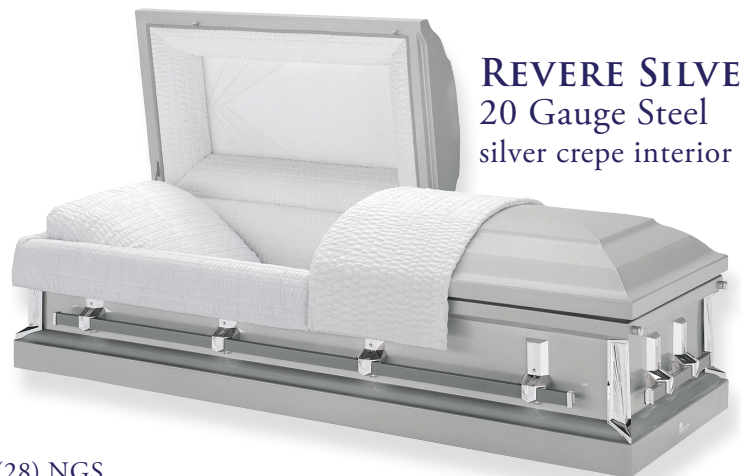
REVERE SILVER 20 Gauge Steel silver crepe interior