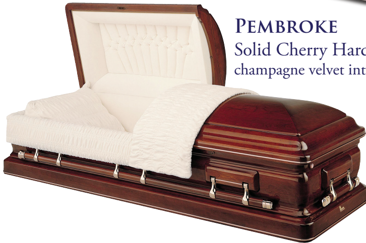
PEMBROKE Solid Cherry Hardwood champagne velvet interior