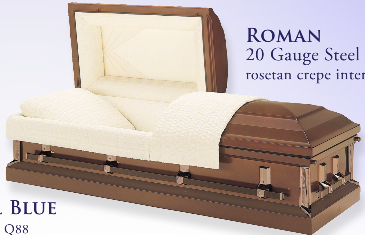
ROMAN 20 Gauge Steel rosetan crepe interior