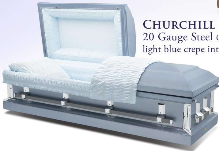
CHURCHILL BLUE 20 Gauge Steel Q88 light blue crepe interior