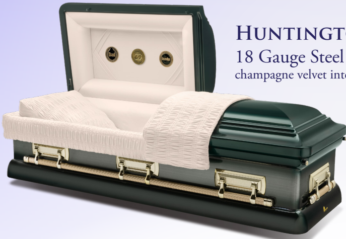
HUNTINGTON GREEN 18 Gauge Steel OT9 champagne velvet interior

CONTINENTAL polymer lined 2,000 lb. concrete burial vault