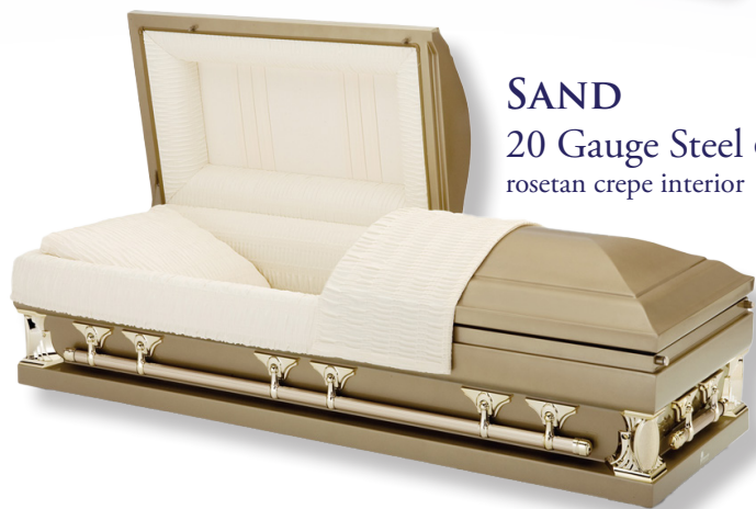
SAND 20 Gauge Steel OS9 (28) rosetan crepe interior