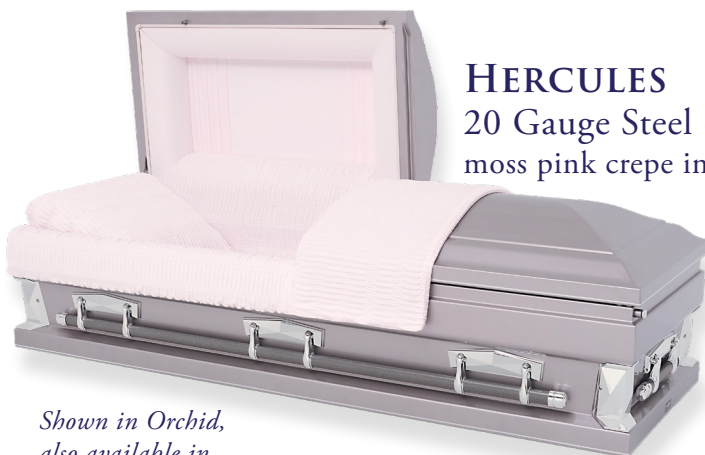
HERCULES 20 Gauge Steel (28) NGS moss pink crepe interior

Shown in Orchid, also available in White, Silver, and Black.