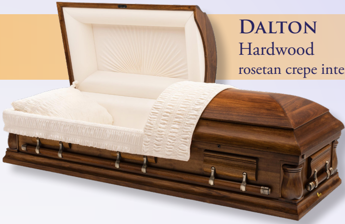
DALTON Hardwood rosetan crepe interior