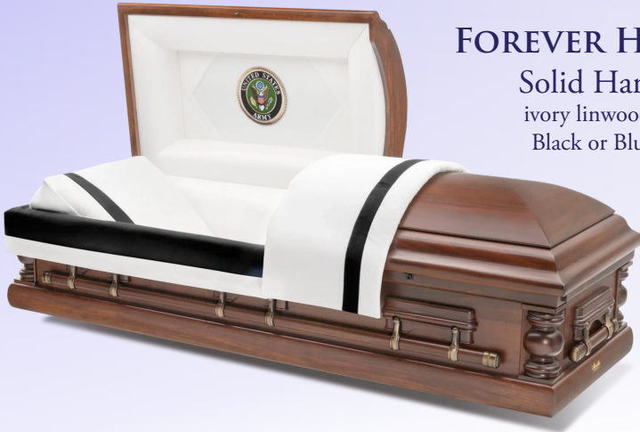
FOREVER HONORED Solid Hardwood ivory linwood interior Black or Blue accent