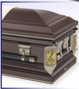
AUBURN 20 Gauge Steel M39 champagne velvet interior