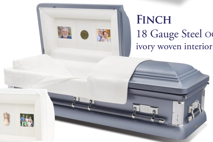
FINCH 18 Gauge Steel OC1 ivory woven interior