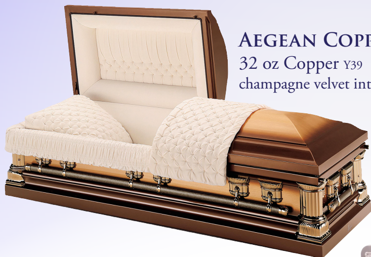
AEGEAN COPPER 32 oz Copper Y39 champagne velvet interior