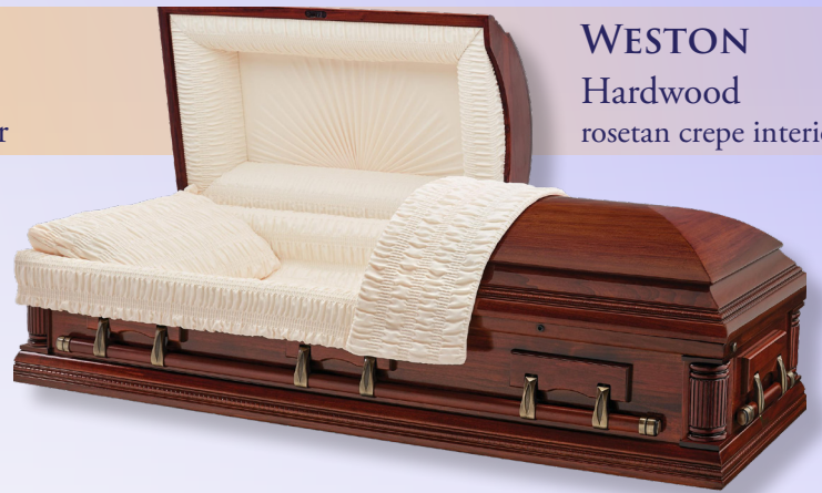
WESTON Hardwood rosetan crepe interior