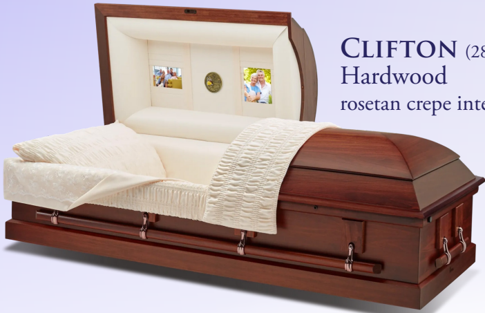
CLIFTON (28) Hardwood rosetan crepe interior