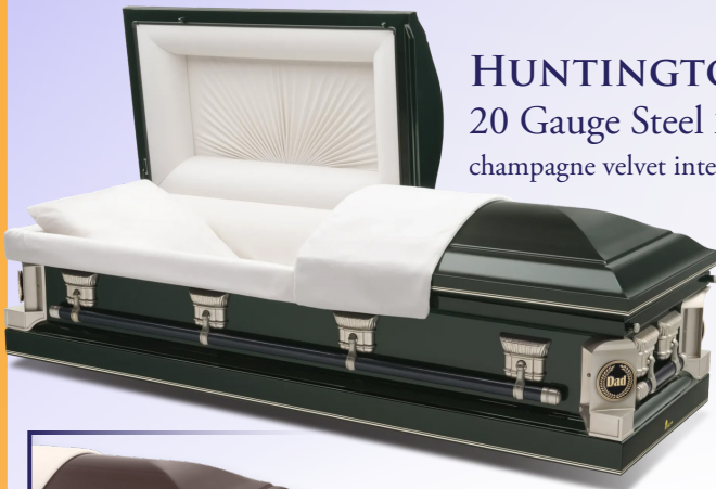
HUNTINGTON GREEN 20 Gauge Steel M39 champagne velvet interior