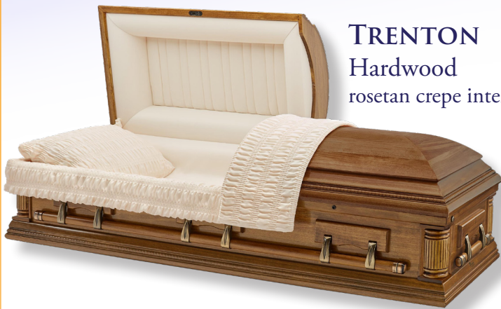
TRENTON Hardwood rosetan crepe interior