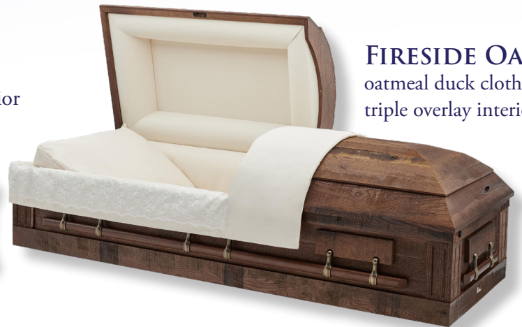
FIRESIDE OAK oatmeal duck cloth triple overlay interior