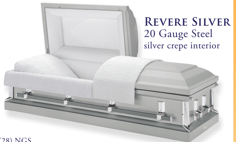
REVERE SILVER 20 Gauge Steel silver crepe interior