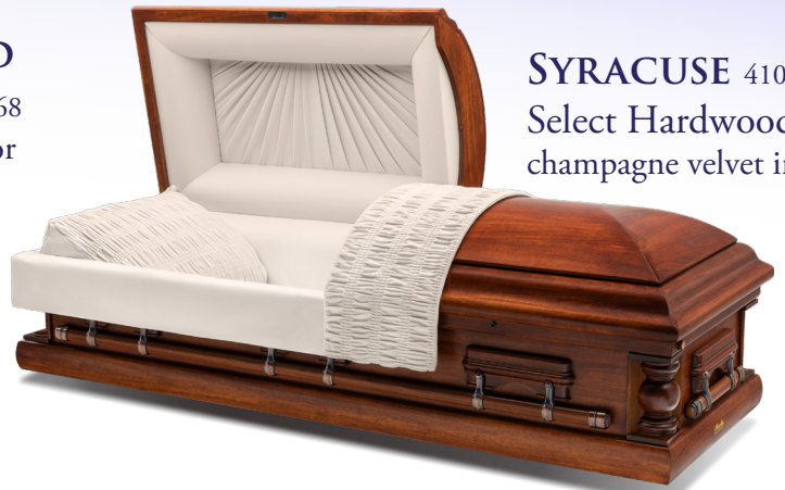
SYRACUSE 410 Select Hardwood champagne velvet interior