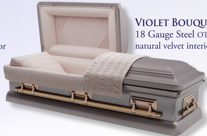
VIOLET BOUQUET 18 Gauge Steel OT9 natural velvet interior