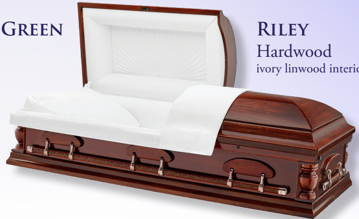
RILEY Hardwood ivory linwood interior