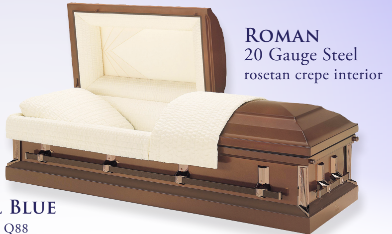
ROMAN 20 Gauge Steel rosetan crepe interior