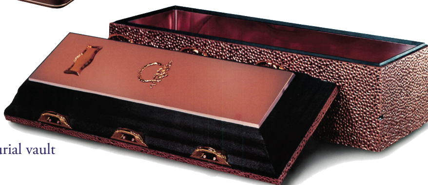
COPPER TRIUNE copper and polymer lined 3,000 lb. concrete burial vault