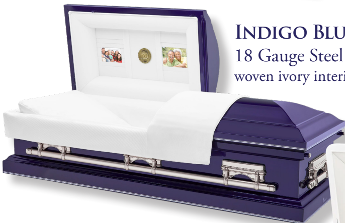
INDIGO BLUE 18 Gauge Steel NL1 woven ivory interior