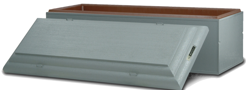
MONTICELLO polymer lined 2,000 lb. concrete burial vault

Shown in Orchid, also available in White, Silver, and Black.