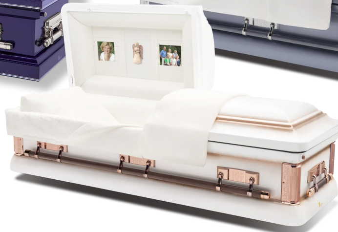
CARNATION 18 Gauge Steel OC1 ivory woven interior