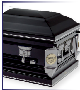
MIDNIGHT 20 Gauge Steel M39 ivory velvet interior