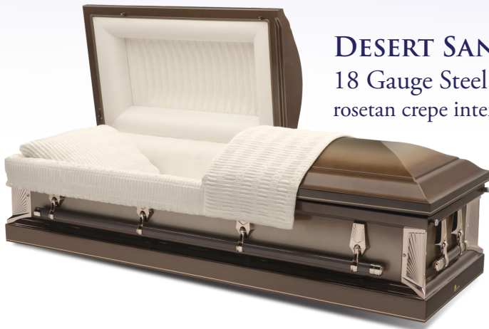
DESERT SAND 18 Gauge Steel P68 rosetan crepe interior