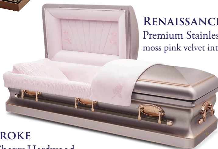
RENAISSANCE ROSE Premium Stainless Steel OR6 moss pink velvet interior