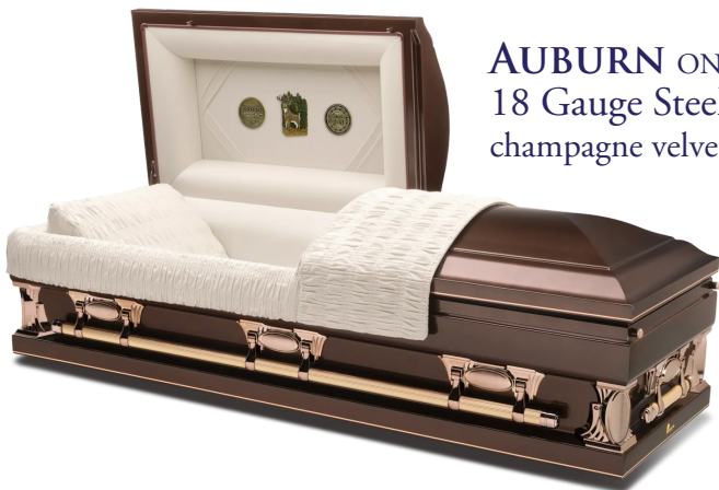
AUBURN ON8 18 Gauge Steel champagne velvet interior