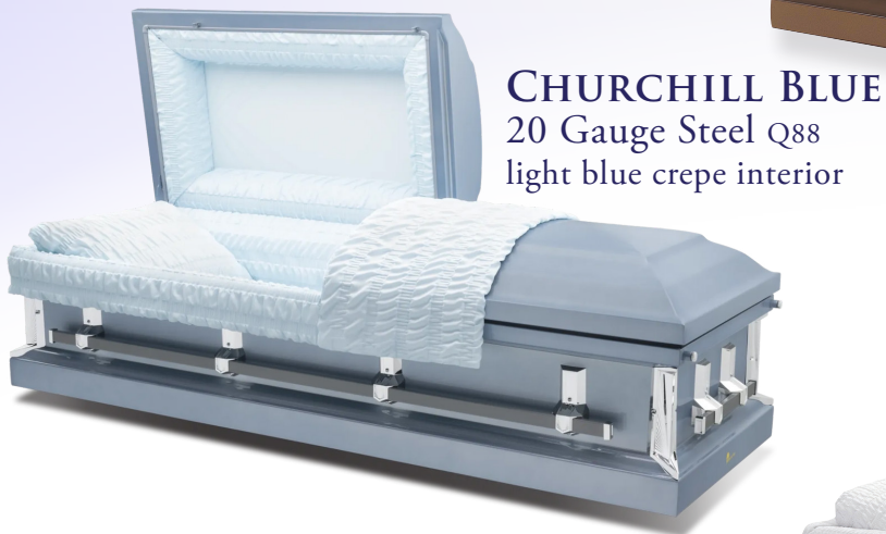
CHURCHILL BLUE 20 Gauge Steel Q88 light blue crepe interior