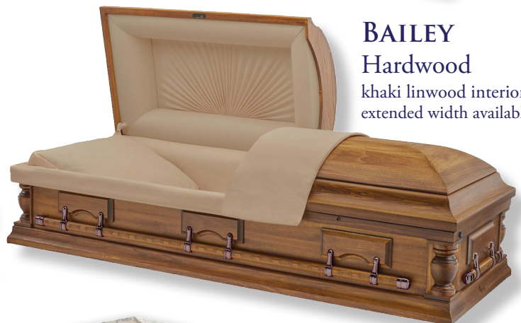
BAILEY Hardwood khaki linwood interior extended width available (28)