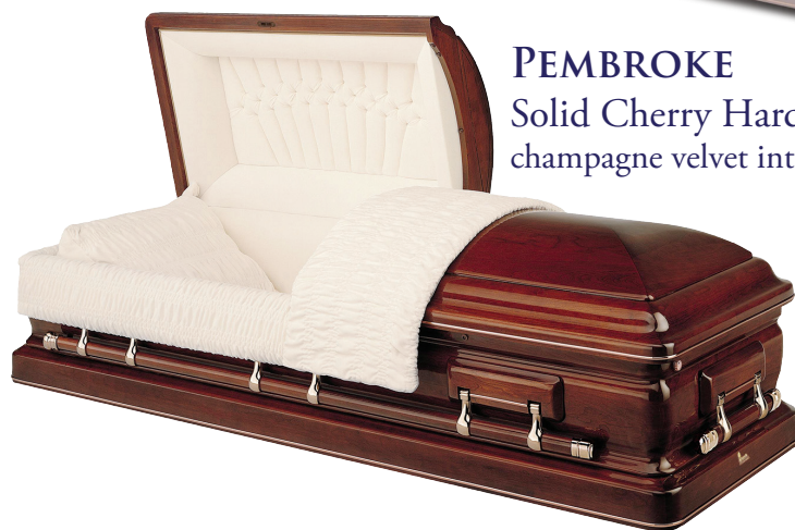
PEMBROKE Solid Cherry Hardwood champagne velvet interior