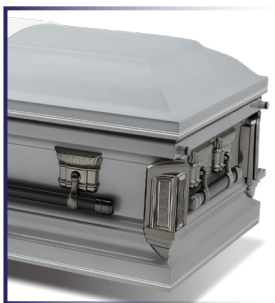
REVERE SILVER 20 Gauge Steel M39 ivory velvet interior