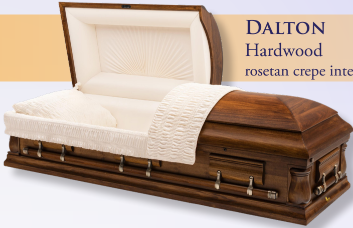
DALTON Hardwood rosetan crepe interior