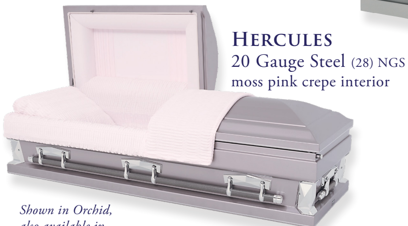
HERCULES 20 Gauge Steel (28) NGS moss pink crepe interior

Shown in Orchid, also available in White, Silver, and Black.