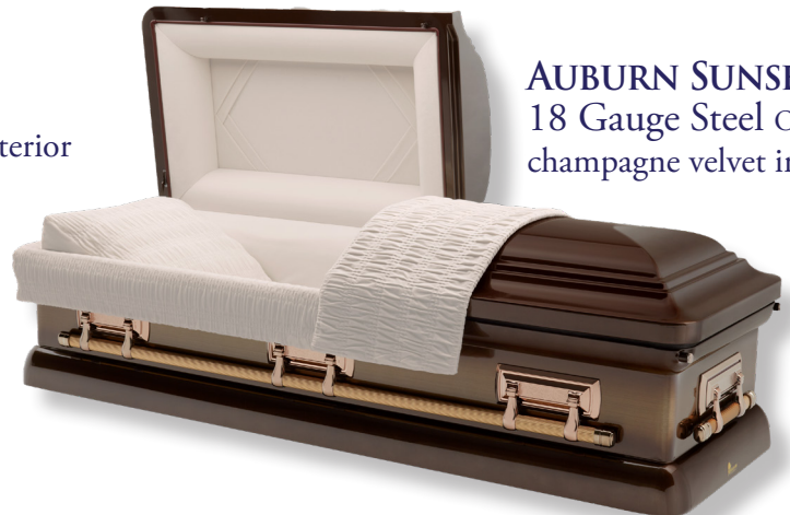
AUBURN SUNSET 18 Gauge Steel OT9 champagne velvet interior