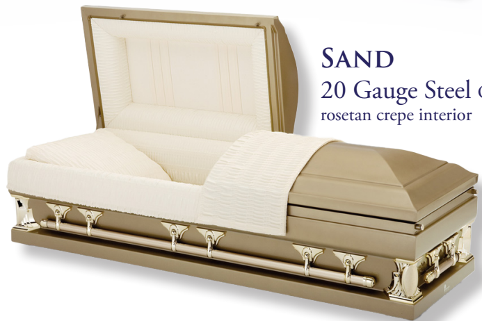
SAND 20 Gauge Steel OS9 (28) rosetan crepe interior