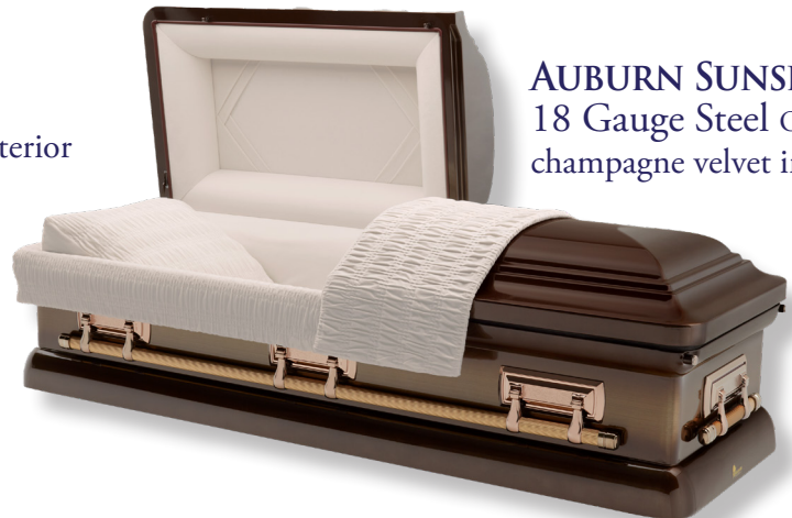
AUBURN SUNSET 18 Gauge Steel OT9 champagne velvet interior