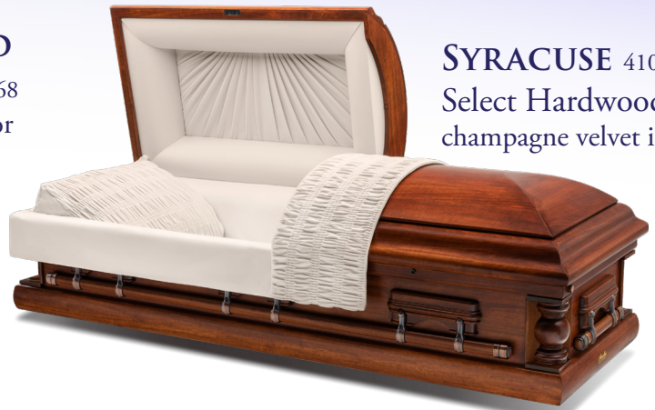
SYRACUSE 410 Select Hardwood champagne velvet interior