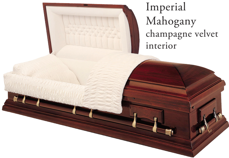
Imperial Mahogany champagne velvet interior