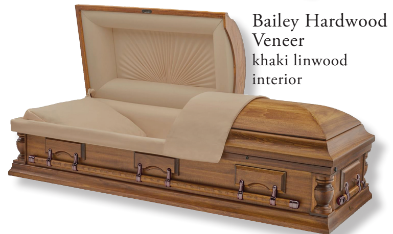
Bailey Hardwood Veneer khaki linwood interior

Aegean Healing Tree polymer wrapped, 2,600 lb. non-exposed concrete burial vault with tree of life cover