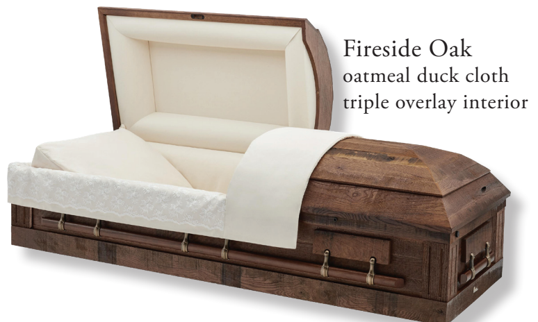
Fireside Oak oatmeal duck cloth triple overlay interior