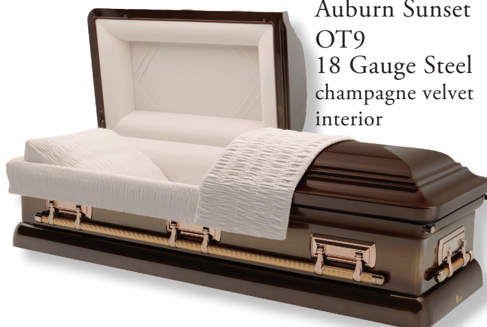
Auburn Sunset OT9 18 Gauge Steel champagne velvet interior