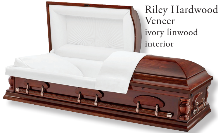
Riley Hardwood Veneer ivory linwood interior