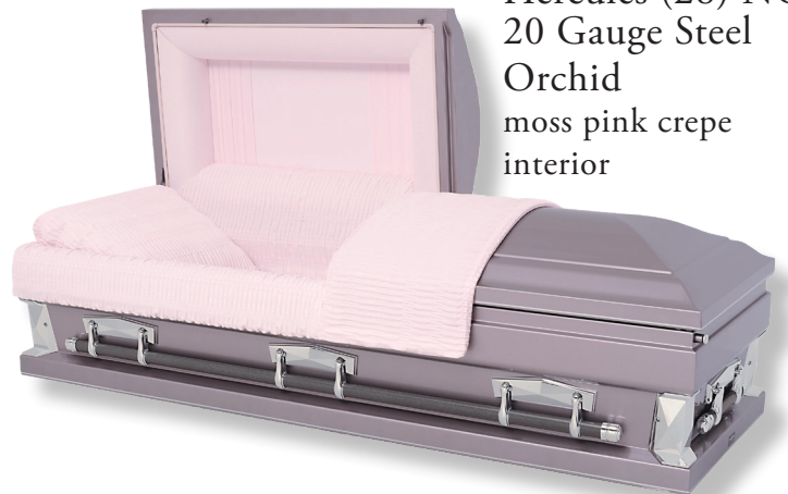
Hercules (28) NGS 20 Gauge Steel Orchid moss pink crepe interior

* Also available in Blue, Silver, and Black.