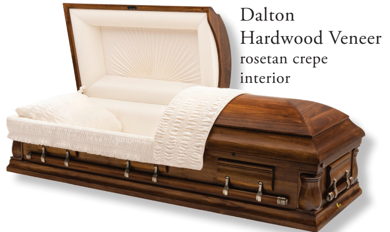
Dalton Hardwood Veneer rosetan crepe interior