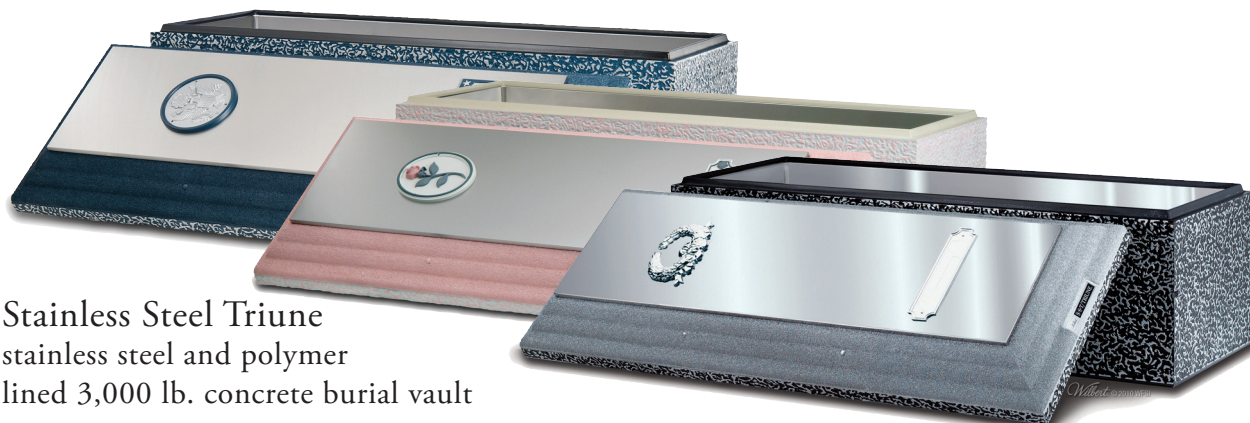
Stainless Steel Triune stainless steel and polymer lined 3,000 lb. concrete burial vault