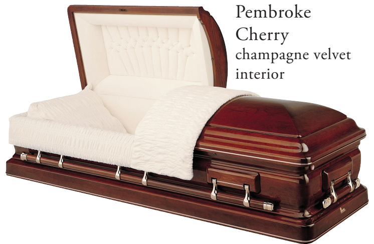
Pembroke Cherry champagne velvet interior