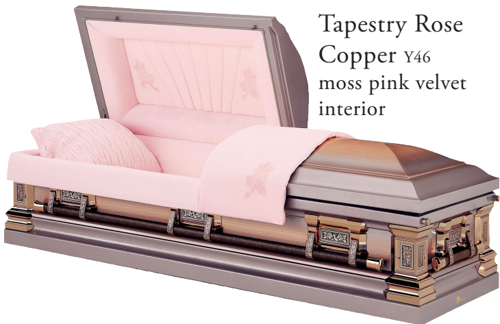
Tapestry Rose Copper Y46 moss pink velvet interior