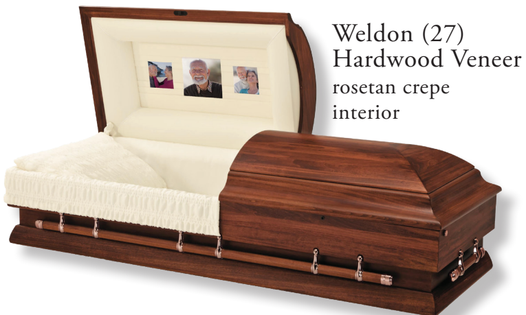
Weldon (27) Hardwood Veneer rosetan crepe interior