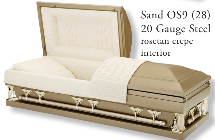
Sand OS9 (28) 20 Gauge Steel rosetan crepe interior