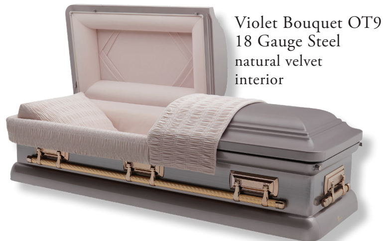
Violet Bouquet OT9 18 Gauge Steel natural velvet interior