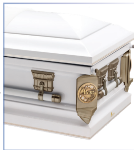
Carnation M39 ivory velvet interior