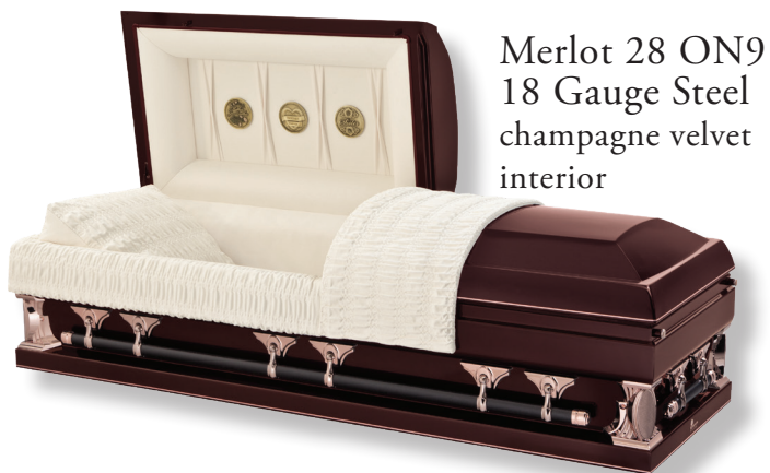
Merlot 28 ON9 18 Gauge Steel champagne velvet interior