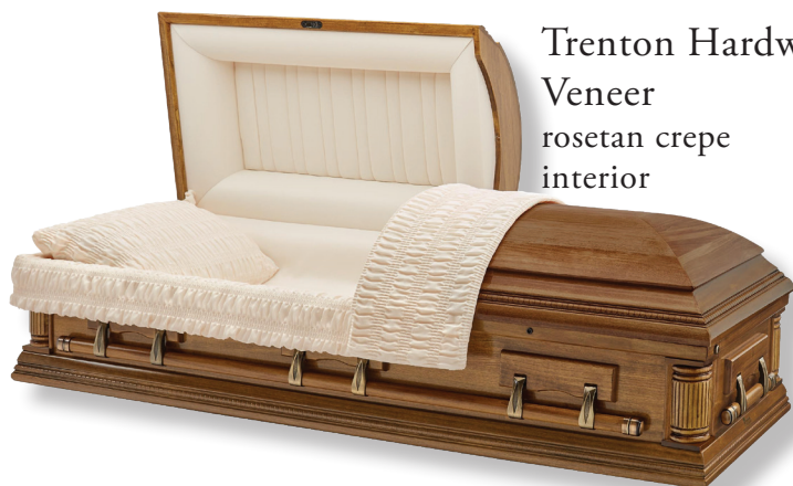
Trenton Hardwood Veneer rosetan crepe interior