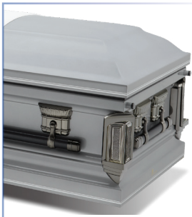
Revere Silver M39 ivory velvet interior