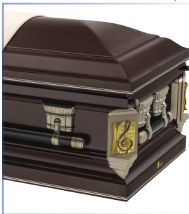
Auburn M39 champagne velvet interior