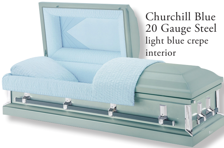
Churchill Blue 20 Gauge Steel light blue crepe interior