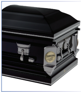
Midnight M39 ivory velvet interior