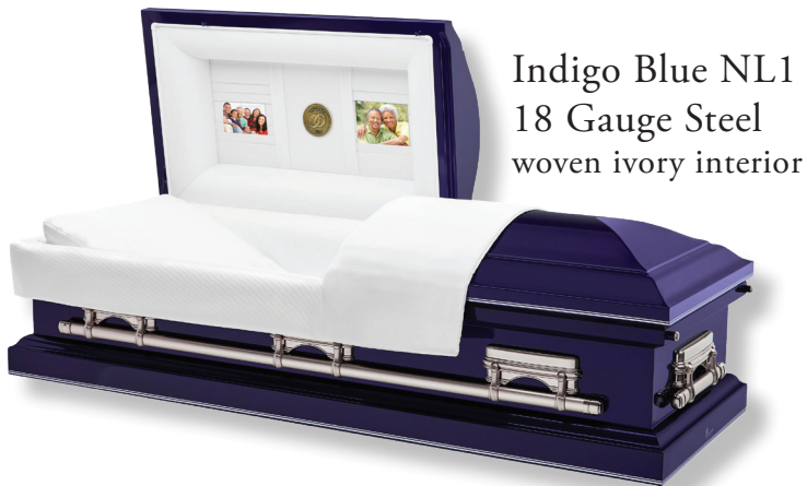
Indigo Blue NL1 18 Gauge Steel woven ivory interior