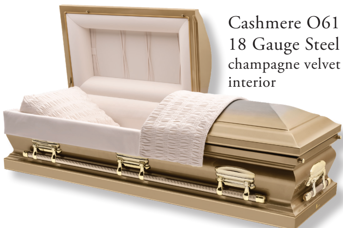
Cashmere O61 18 Gauge Steel champagne velvet interior