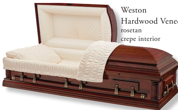
Weston Hardwood Veneer rosetan crepe interior