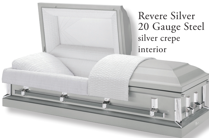
Revere Silver 20 Gauge Steel silver crepe interior