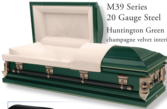
M39 Series 20 Gauge Steel Huntington Green M39 champagne velvet interior