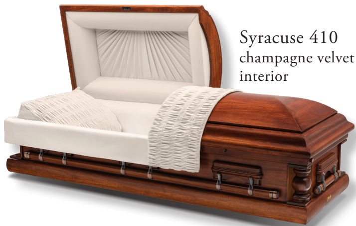
Syracuse 410 champagne velvet interior