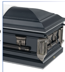
Neopolitan Blue M39 ivory velvet interior