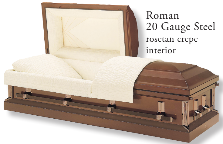
Roman 20 Gauge Steel rosetan crepe interior