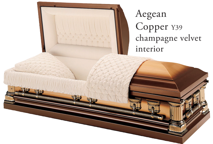
Aegean Copper Y39 champagne velvet interior